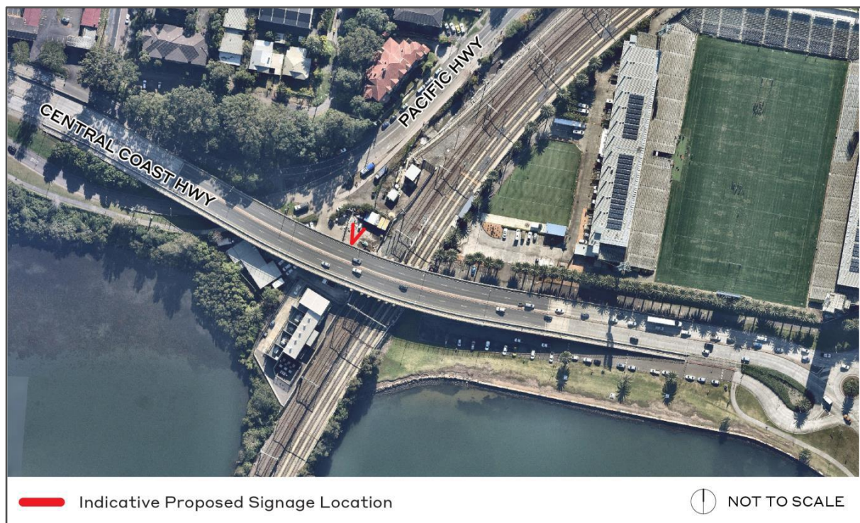
Figure 1 | Local Context Map

The Central Coast Highway is classified as a highway under the Roads Act 1993 . The highway carries two lanes of traffic in each direction and the existing speed limit is 60 km/hr. The highway includes an off ramp exit to the Pacific Highway upon approach to the site.