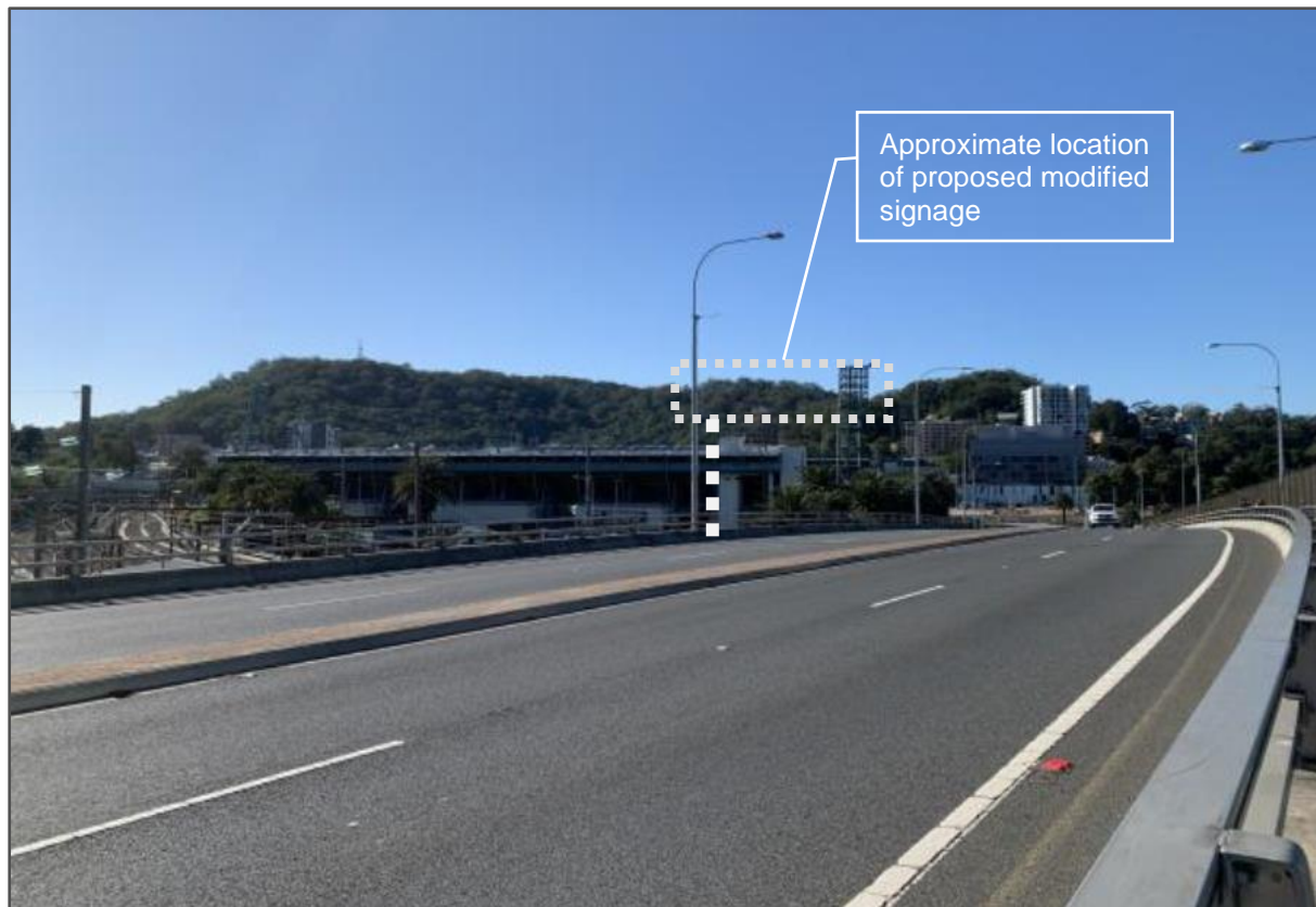
Figure 2 | View of the proposed modified sign location from the southern pedestrian pathway looking north-east

The railway corridor travels in a north-south direction and comprises part of the Central Coast & Newcastle Rail Line. The corridor includes a total of five separate railway tracks. There are no existing signs or advertising billboards within the vicinity of the site (Figure 2) .